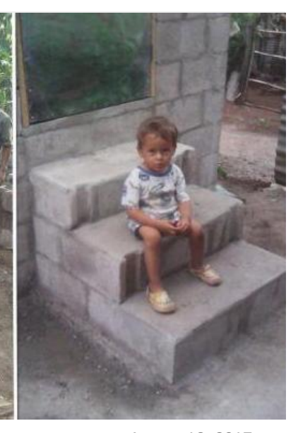
August 12, 2017