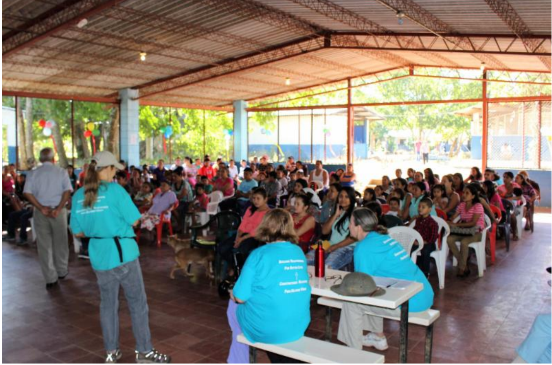
2017 Scholarship Awards Ceremony